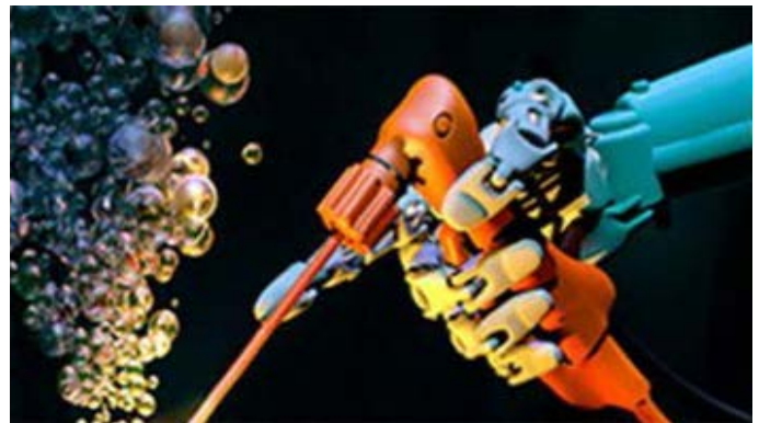
Case Study: Custom waterproof assemblies for an underwater robotic tool system. Designed to function under extreme pressure.