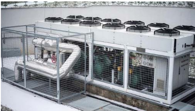
Case Study: Harsh environment sealed M12 assembly for industrial HVAC unit.

Our design engineering team can assist in designing custom connectors and cable assemblies.