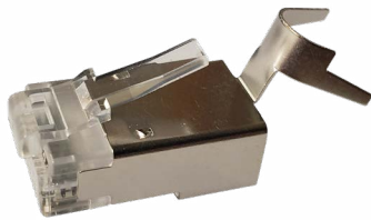
CAT8 Plug Solid Wire Contacts