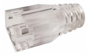
CAT6 Strain Relief PC Clear