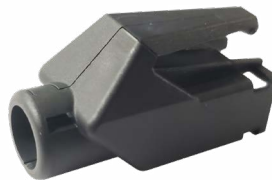
Plastic Hood Compatible with MTP-88-X-EMI-SP1