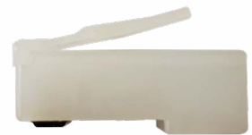
CAT5 Plug Plug for Round Cable