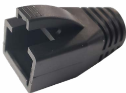
CAT8 Strain Relief PVC Black 6.5mm hole