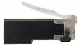
CAT6A Plug Solid Wire Contacts