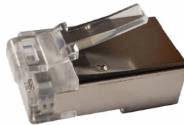
CAT6A Plug Solid Wire Contacts