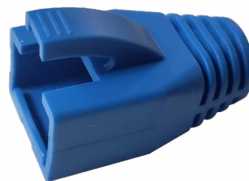
CAT8 Strain Relief PVC Blue 6.5mm hole