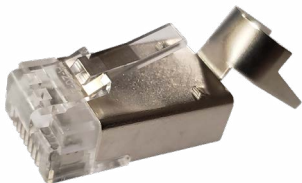
CAT6 Plug Solid Wire Contacts