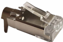
CAT5 Plug Metal Shielded