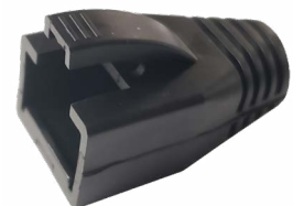
CAT8 Strain Relief PVC Black 8.0mm hole