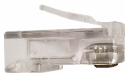
CAT6 Plug Solid Wire Contacts Plug for Round Cable